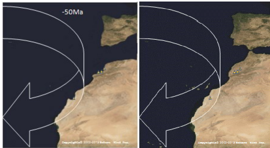
FIGURE 2. Phosphate-rock deposits 50 Million years ago (left) and actual sites (right)

Used essentially in the production of fertilizers, Phosphate-rock requires an upgrade into higher value-added derivatives for plant uptakes, such as Phosphoric acid. As Ammonia, which is synthesized through energy-intensive processes, is also needed in the formulation of fertilizers according to the plant's NPK Nitrogen-Phosphorus-Potash elementary requirements, an unprecedented opportunity arises to take advantage of the trade winds.