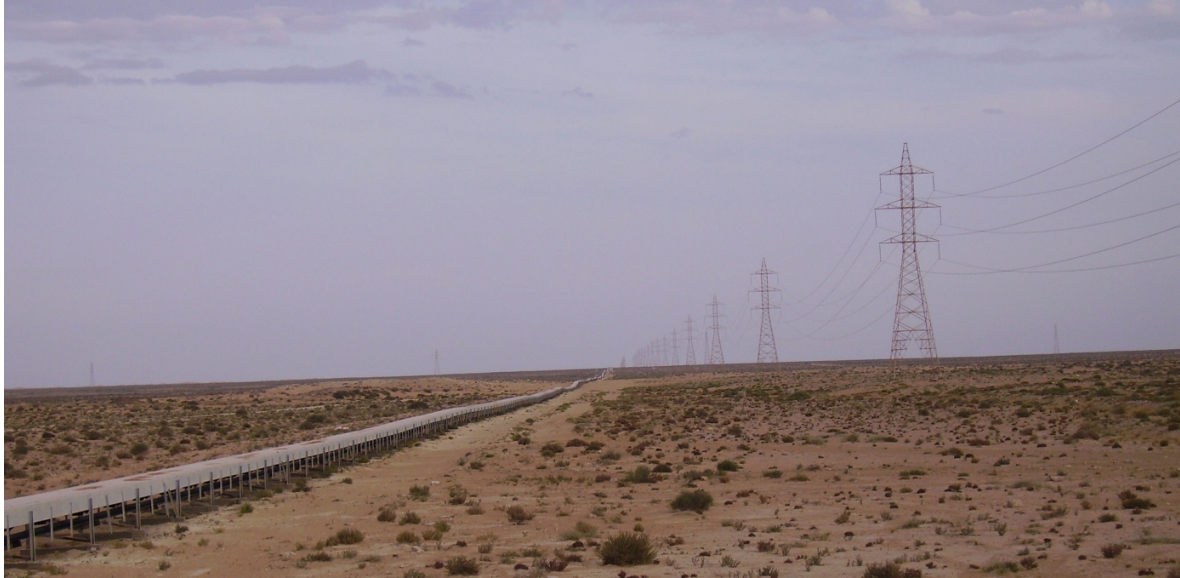
FIGURE 3 Phosphate-rock conveyor belt adjacent to a 125 kV power line near Phosboucraâ

Over 554 MW of Morocco's 1 GW current wind capacity operates on the Atlantic trade wind-blown Sahara coastline. Besides urban load centres such as Laayoune and Boujdour that are supplied by wind-electricity, the bulk of the region's electric loads consists in reverse-osmosis desalination plants. In addition to conveying phosphate-rock, they also power their screening and washing prior to exports.