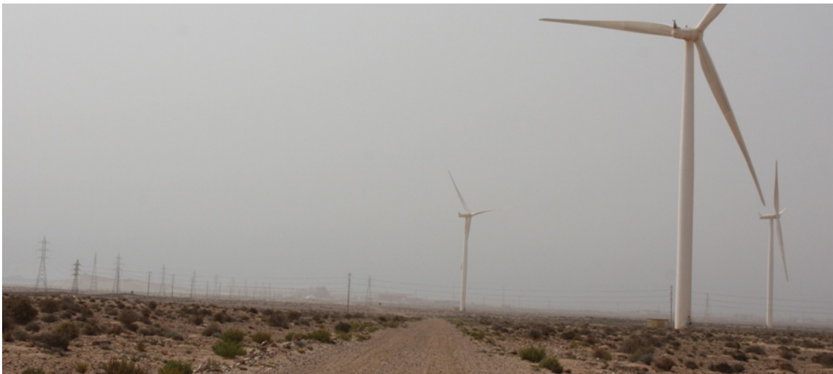
FIGURE 4. Foun El Oued Wind farm Turbines over Phosboucraâ export terminal (in the background)

As wind capacities exceed by far the region's loads, local electricity-intensive phosphate-rock upgrades into fertilizer becomes economically viable. Morocco's Renewable Energy Law 13-09, enables wind-electricity to be wheeled directly to industrial end-users. The Phosboucraâ phosphate-rock export terminal is for that matter powered by several wind farms, such as the Foun El Oued 51 MW wind farm (below), adjacent to it.